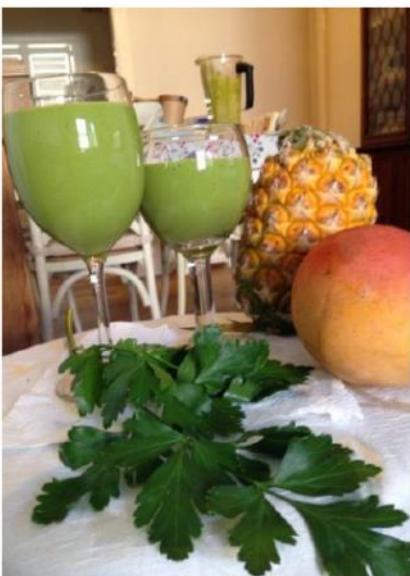
Juicing: Vegetables and fruits.

A radiation oncologist then recommended 29 radiation treatments before Christmas 2021 and I asked her endless questions at our first consultation and during multiple follow-up phone consults and took the time to pray and research my options.