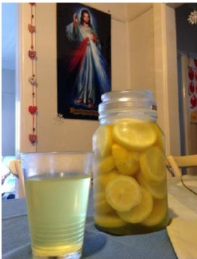
Lemon water to balance pH.

I chose the naturopathic way to treat cancer and this has been my journey but it is not the easiest way and it is not for everyone. My girlfriend, a faithful Christian, chose the traditional path of surgery, chemotherapy and radiation. And along with her strong faith in God, she has survived cancer for more than 20 years. She is one of my many wonderful prayer warriors.