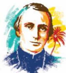
Saint Peter Chanel