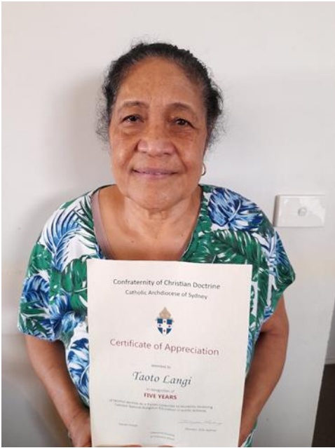
Taoto loves teaching 'the little children'.