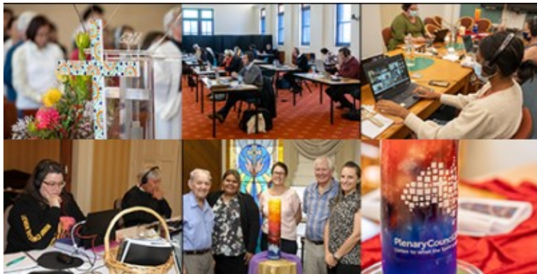
Scenes from Plenary Council first assembly in October

Published by Cath News: 09 December 2021