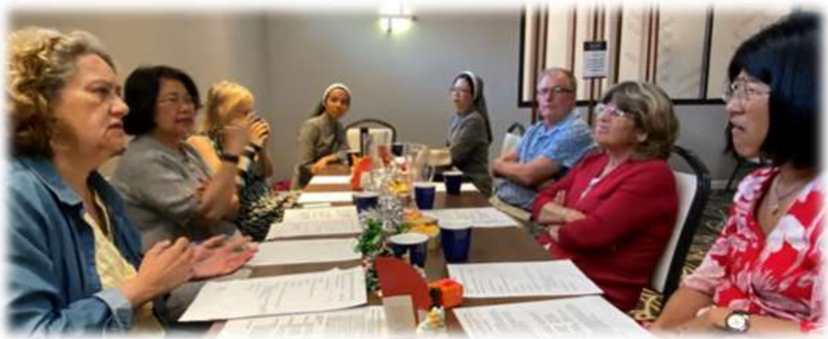
Our parish is blessed to have Religious Sisters with evangelisation ministry.