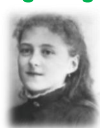
Saint Therese of Lisieux

The Parish is getting ready to receive the relics of Saint Therese and her parents, on Monday 16 March morning.