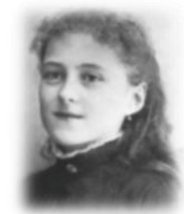
Saint Therese of Lisieux

The Parish is getting ready to receive the relics of Saint Therese and her parents, on Monday 16 March morning.