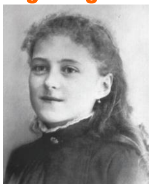
Saint Therese of Lisieux

For the first time in nearly 20 years, the relics of St Thérèse of Lisieux, one of the most popular Saints of modern times, will visit Australia on a four-month pilgrimage along with the major relics of her parents, Saints Louis and Zélie Martin.