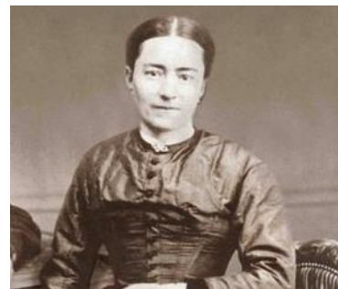
Saint Zélie Martin

From February to May 2020, the family's relics will travel across the country to 17 dioceses in city and rural areas, with major opportunities for devotees in Sydney. The pilgrimage is being coordinated by Catholic Mission, in partnership with InvoCare, and will link with InvoCare's funeral homes, including WN Bull Funerals and Guardian Funerals in Sydney.