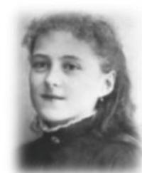
Saint Therese of Lisieux

The family of St Therese is coming to Berala. It is the first time a couple and their daughter are all canonised saints. Sainly couple Louis & Zelig Martin are patron saints of married couples.