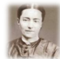
Saint Zelig Martin

Procession also requires, a processional cross bearer, Acolytes, 2 torch bears, and a thurible bearer. The relics will be processed into the church with hymns. It will be followed by prayers and reflections. It will also offer opportunity for the faithful to venerate them.