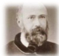
Saint Louis Martin

A Holy Mass will be celebrated at 9.00 AM. The liturgy also requires Acolytes and Altar Servers. After the Mass, there will be more opportunity for veneration of the Relics. The Parish Primary Schools will also be conducting prayer services till 1.00 PM.