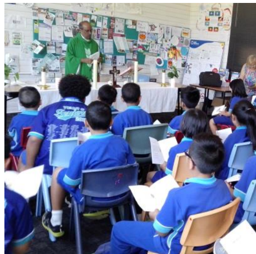
Students celebrate Mass in the classroom.