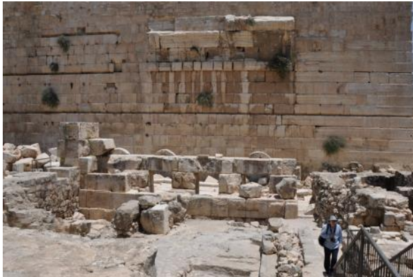
Ruins of Jerusalem Temple