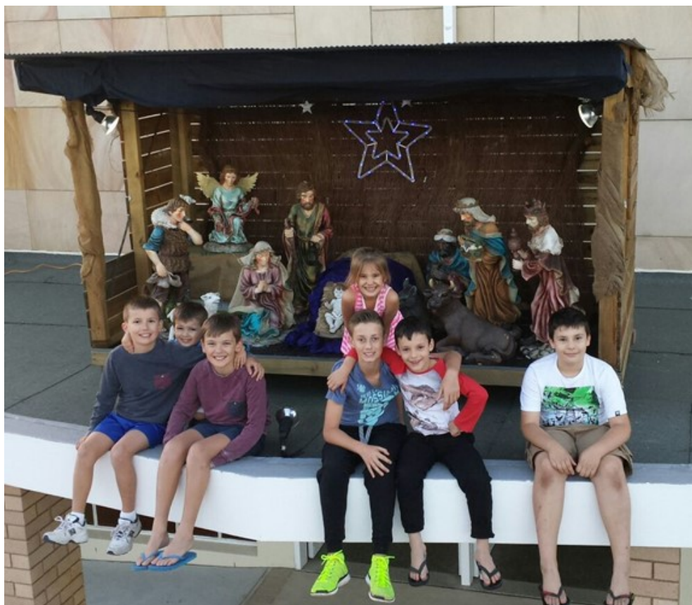
Children celebrating the making of a Crib on the porch of SPC Church