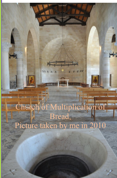
Church of Multiplication of Bread, Picture taken by me in 2010

Therefore we come together to celebrate the Eucharist. Through this great Sacrament, God nourishes us. We realise that the deepest hunger is satisfied by God this way. Our total trust in God and total obedience to God is the best remedy for worries and troubles we find hard to handle ourselves. So if there are issues troubling you, come along to Mass and connect with God in a special way through Holy Communion. Then discern God's will as Jesus prayed, "Abba,.. but your will be done". He will feed us with a healthy and satisfying spiritual food. Mother Teresa, who found spiritual strength in Holy Communion for all her great works, is an inspiration for all of us. So for our own good let us submit ourselves to God totally and seek the spiritual food of heaven to satisfy our real hunger.