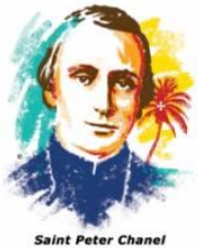
Saint Peter Chanel