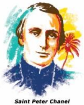
Saint Peter Chanel