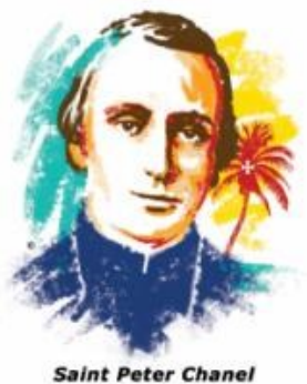
Saint Peter Chanel