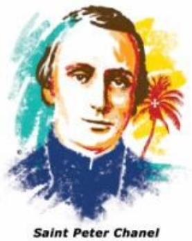
Saint Peter Chanel