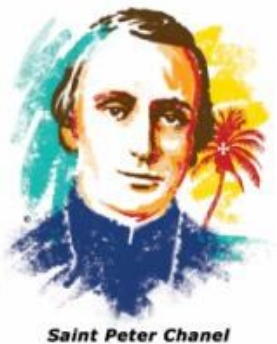
Saint Peter Chanel