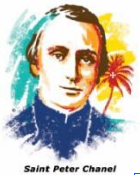
Saint Peter Chanel