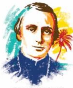
Saint Peter Chanel