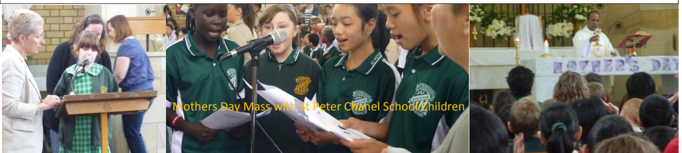
Mothers Day Mass with St Peter Chanel School Children

May the great mothers who have for their eternal reward continue to inspire their dear ones on earth.