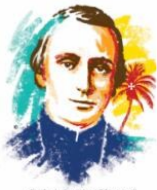
Saint Peter Chanel