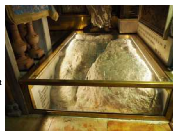
Stone of Unction

Ecce Homo where I stay and study is in the Old City of Jerusalem. Al Aqsa Mosque on the site of the Jewish Temple which was destroyed in 70 CE is almost reachable from the terrace of my room. Turn 30 degrees and I can see the Holy Sepulchre, the Empty Tomb and Calvary. This city which is important for all three Abrahamic Religions (Jews, Christians and Muslims) is always buzzling with pilgrims, vendors, and celebrations.