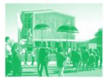
St Peter Chanel & St Joseph Parish, Berala Amount $ _____