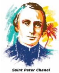
Saint Peter Chanel