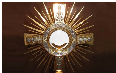
PERPETUAL EUCHARISTIC ADORATION